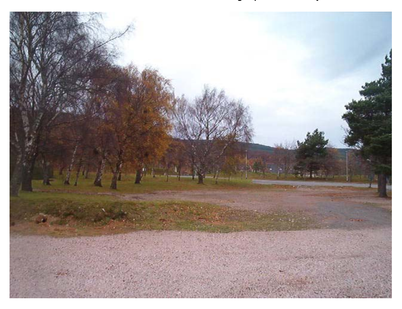
Looking over Block A etc. towards Scandinavian Village