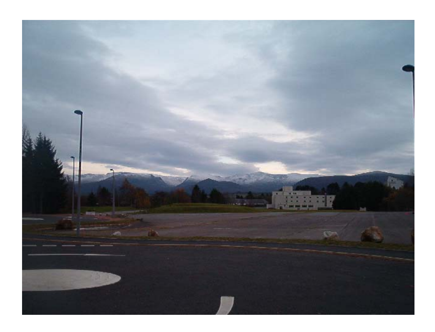
Entrance to Tulloch's site looking across to Development Around Town Square, footbridge on left