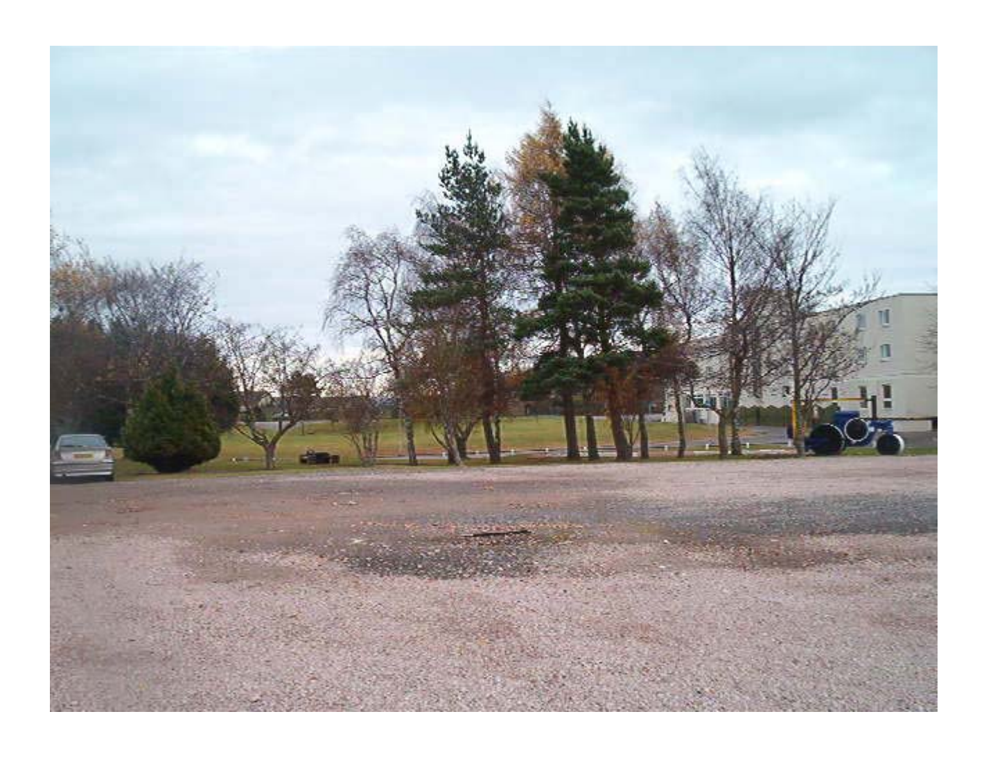
Looking to Academy Hotel on right Blocks J3, C & B on left.