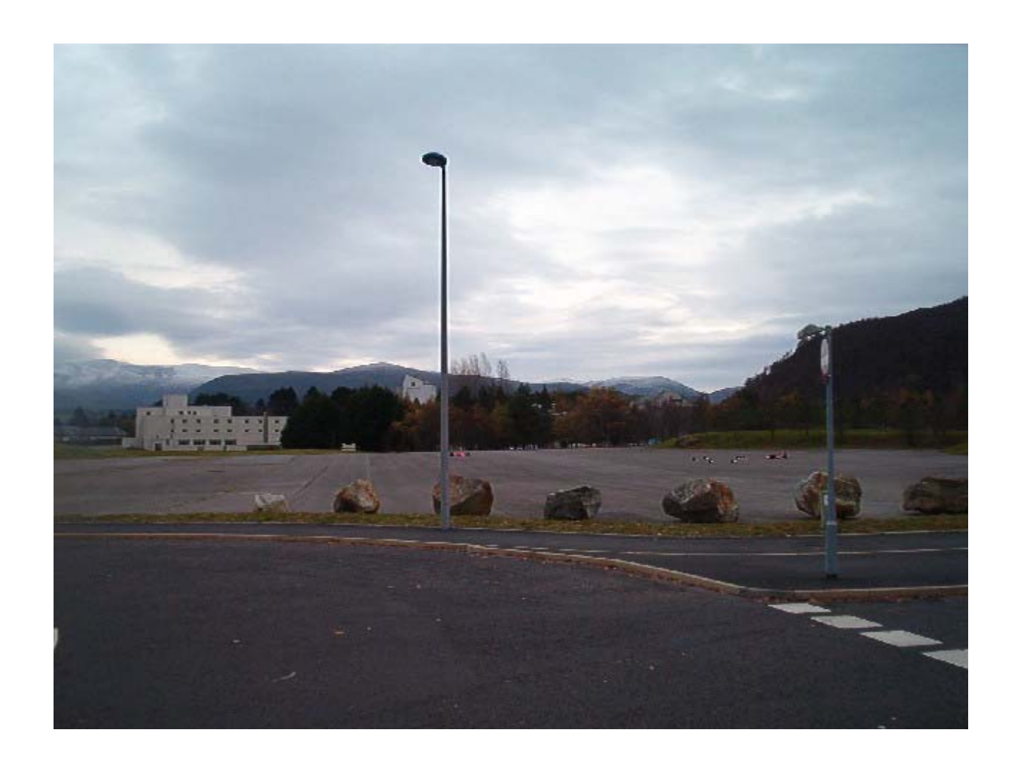
By Entrance to Tulloch Housing Site looking across to Academy Hotel and Blocks A - C, G-H on left and Blocks J2, F, E, J3, J1, D1-2 on right