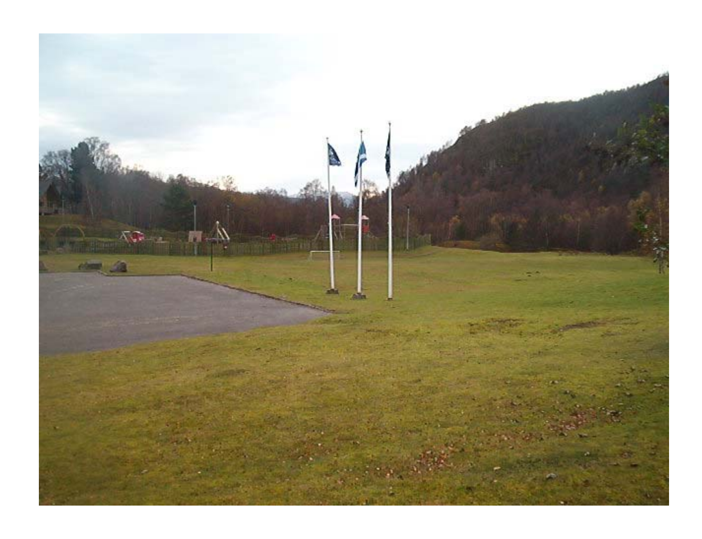
Block L - Future Leisure Development