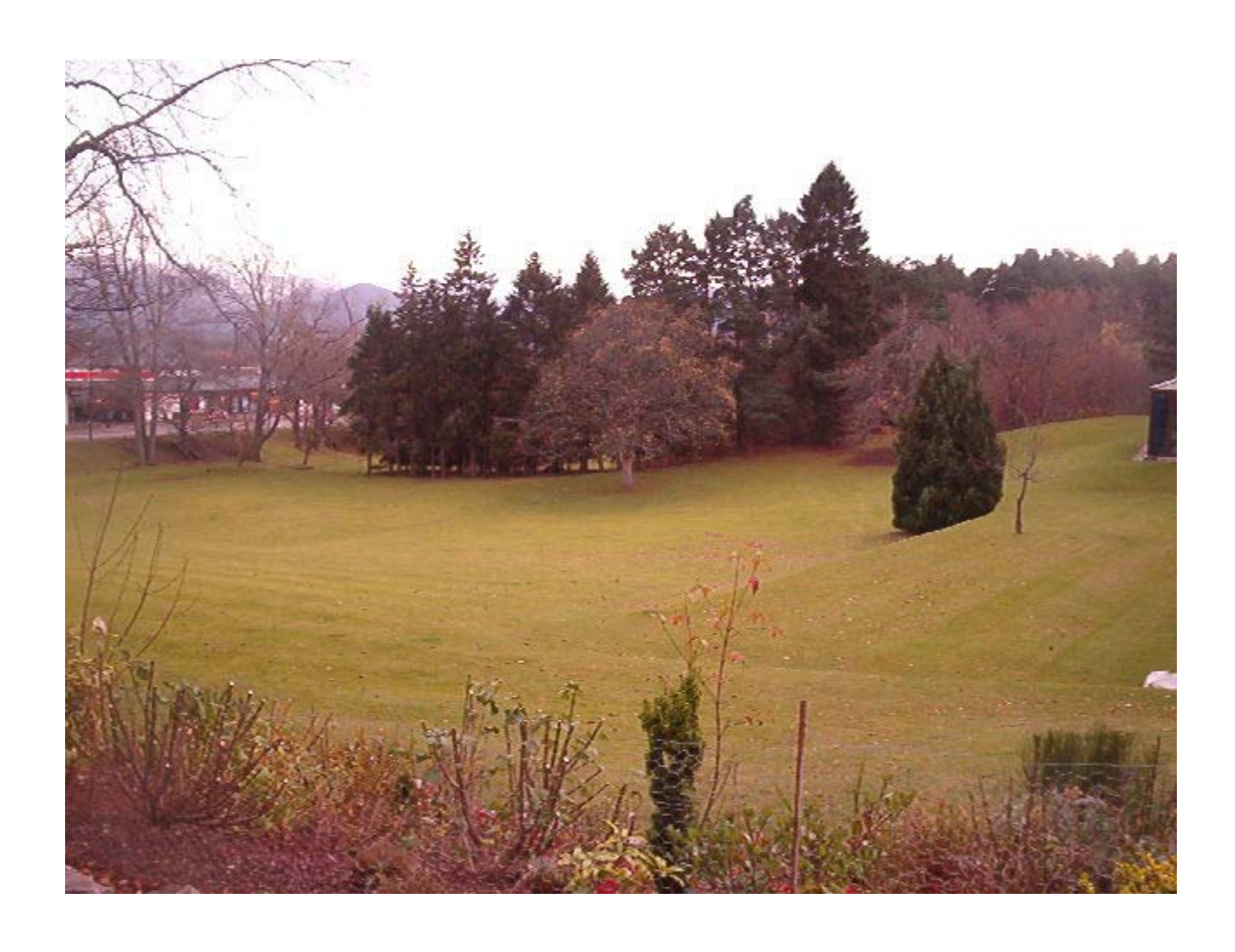
Looking over towards Block M across Strathspey Lawn from Southern Access Road